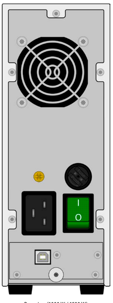
Rear view (1000 W / 1500 W)